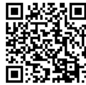
Abiding Savior Lutheran School

Use your smart phone to learn more about us!